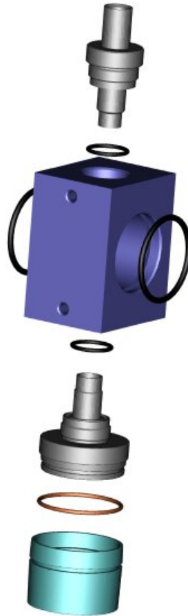
Figure 2: Exploded Adapter